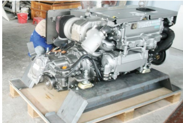
Diesel Marine Engine Yanmar 220HP