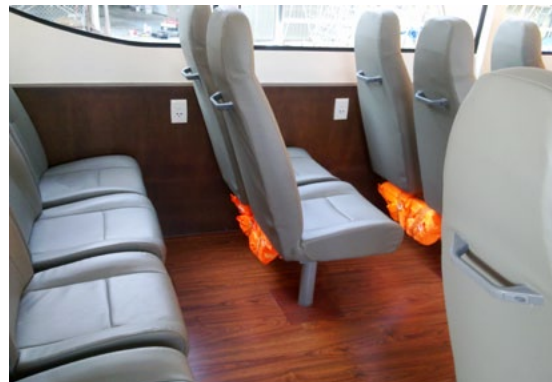
Sockets, Switches and Life Vest for each seat