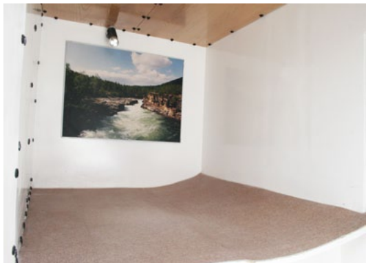
Bedroom in Hull for crew