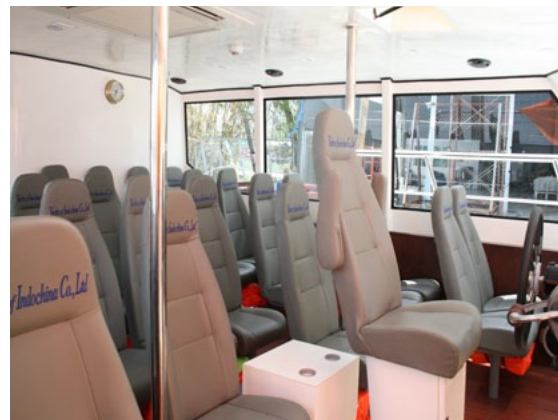
33 comfortable seats _2 for VIP